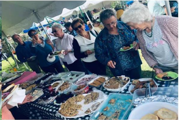
Several Dozen salads and desserts rounded out the BBQ.