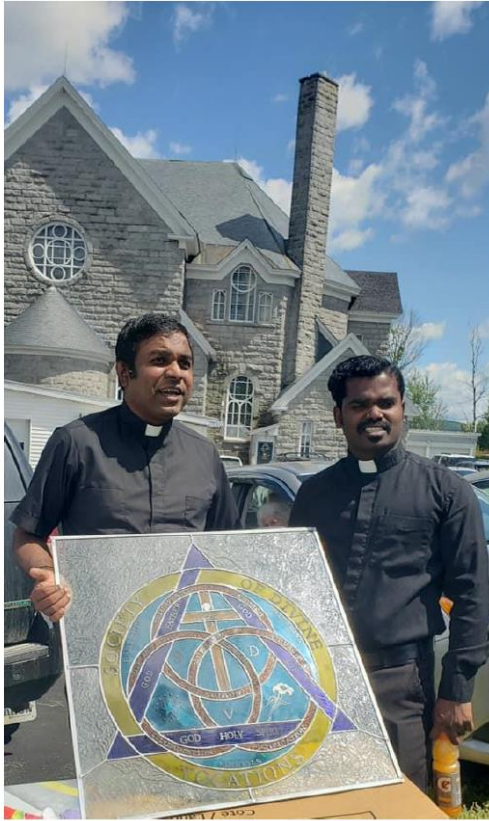
At the left- Parishioners came together to design, purchase and present a new stained glass window in honor of the 10 th Anniversary of the Vocationist Fathers at Mater Dei Parish.